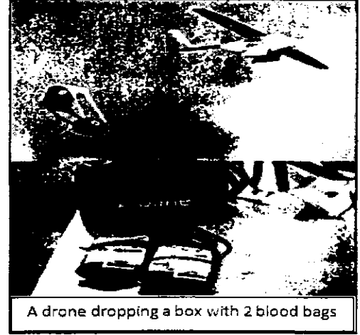
A drone dropping a box with 2 blood bags

[2] Immediately, a hospital employee typed a message on his smart phone. It was a request for two bags of blood. Normally, he would have sent a car and driver to get the blood from a blood bank. This would take 3 hours. But this time, he tried something new. His phone received a confirmation message: The blood was on its way. It would be delivered in a few minutes.